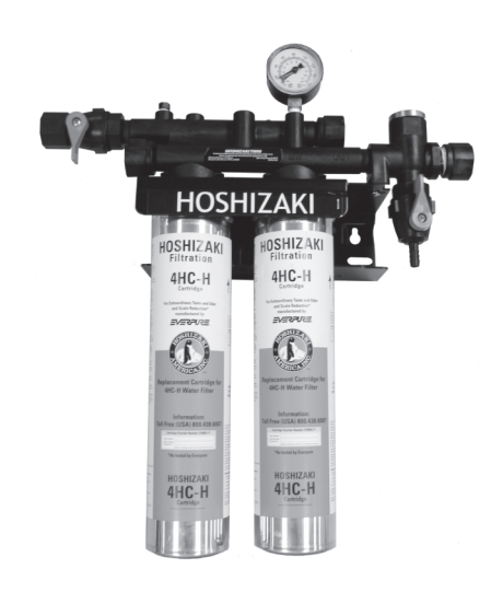
H9320-52 Twin Configuration Shown

*Available in single, twin, and triple configurations